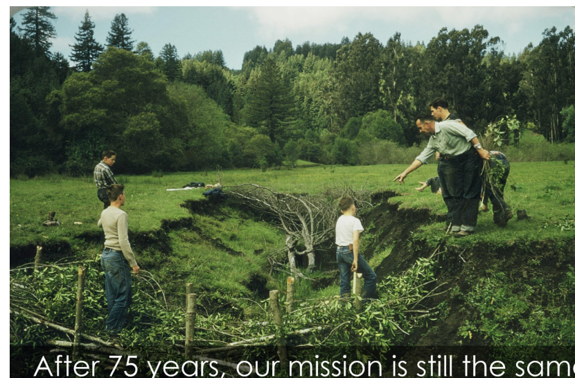
After 75 years, our mission is still the same

◀ VISIT OUR WEBSITE TO SEE A VIDEO CELEBRATING THE RCD'S HISTORY AND OUR 75TH ANNIVERSARY.