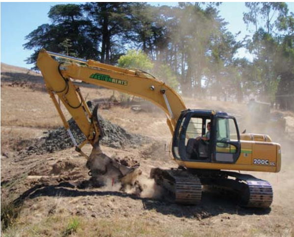
Crews from Prunuske Chatham, Inc above working on the agricultural pilot site for the SOS Program.

SOS is a cooperative effort, with local landowners and resource and construction professionals working with the RCD to design and build projects that will benefit both fish and people in the Salmon Creek watershed. The SOS program will help to stimulate the west county economy in the short term by providing employment in designing and building these projects. The training and experience these workers gain in restoration and resource protection will be invaluable in the emerging green economy. The program will assist local agricultural operators and other landowners in securing a more reliable and diverse water supply without drawing down the creek during the dry season. By building on ongoing