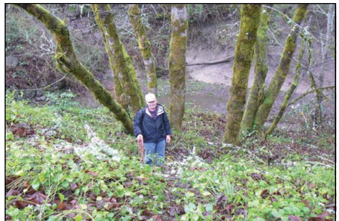
Below: the RCD gets help from our friends when conducting water quality monitoring in Green Valley.