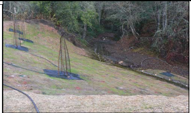
Above: Stream Restoration Project Along Green Valley Creek. Photo taken December 22, 2008