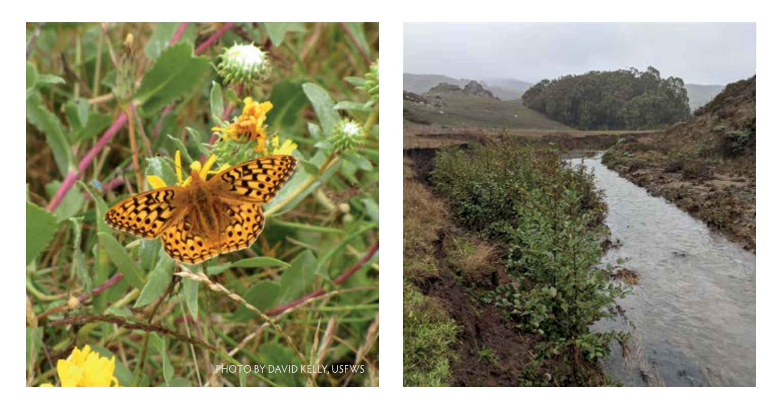
Above left: The endangered Myrtle's silverspot butterfly. Right: Scotty Creek.

coastal terrace prairie and the restoration of native grasslands. This work will enhance and create new habitat for the endangered Myrtle's silverspot butterfly, which is found only on the Sonoma-Marin coast. Mitigation of impacts to wetlands will consist of the enhancement and expansion of existing wetlands adjacent to Scotty Creek.